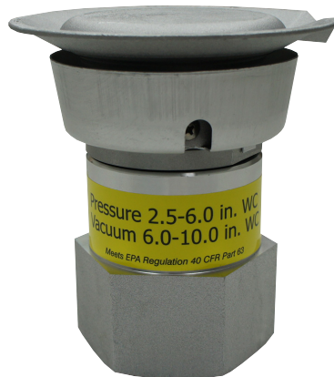
■ UL Listed MH46838